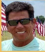
Rock Hall - President