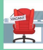
Vacant - Secretary