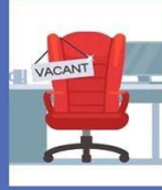
Vacant - Vice President